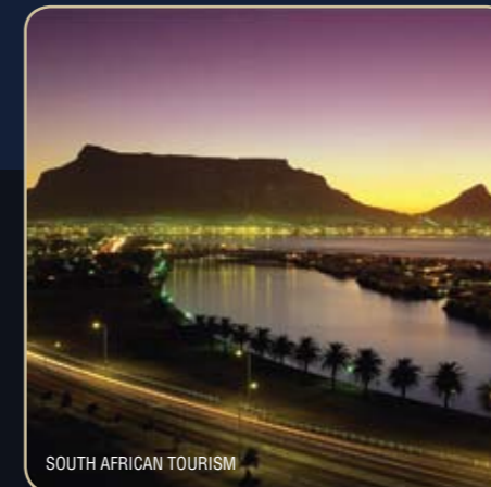
SOUTH AFRICAN TOURISM